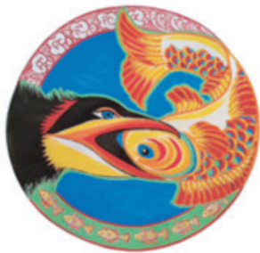
Cormorant Asset Management